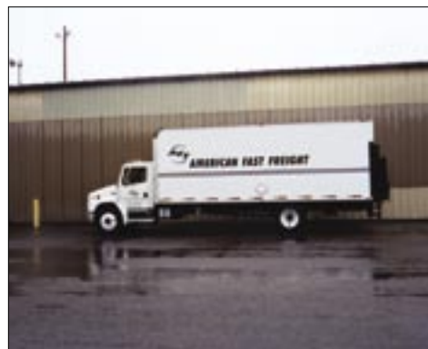
Through a network of contract trucking, intermodal rail, and air freight forwarding partners, we provide seamless transportation from start to finish.

Using climate-controlled trailers, straight trucks, tractor-trailers, flatbeds, and people who know how to handle the unique challenges presented by Alaska, we are prepared to deal with any situation that develops.