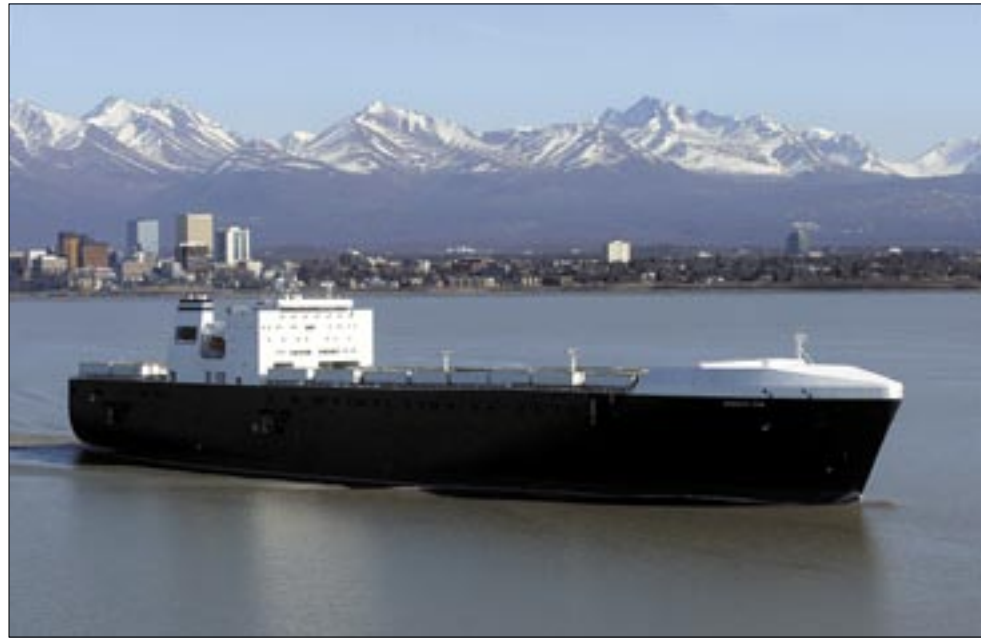
Our receiving and loading terminals in Seattle, Tacoma, Oakland, Los Angeles, and Chicago expedite your shipments to and from Alaska.

We'll get it there, over road, over rail, over water.