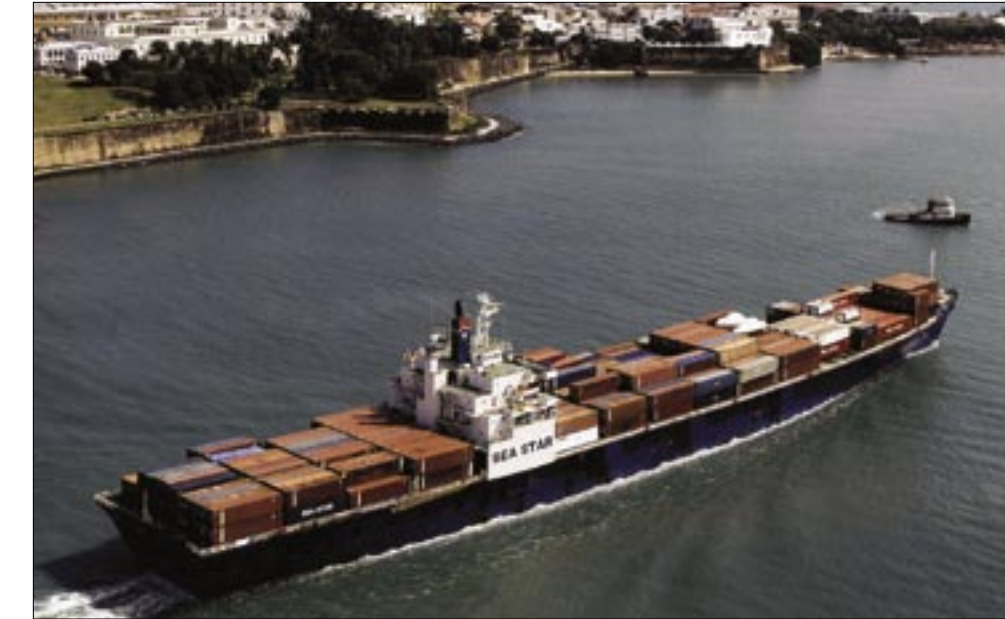
We're experts in shipping to Puerto Rico. After all, we've been doing it for more than 30 years.

We can help you negotiate unfamiliar territory.