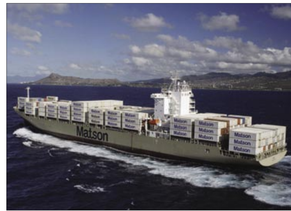
We offer both LCL and FCL service from all West Coast ports to Honolulu, as well as barge service to the outer islands.

We can help you negotiate unfamiliar territory.