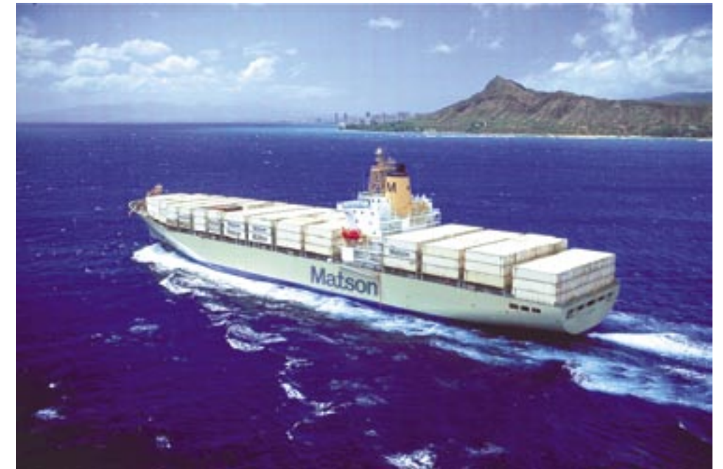
We ship on vessels departing from all of the major West Coast ports with transit times of as little as four days.

We offer sophisticated programs for purchasing agents and buyers. Just provide us with a list of your suppliers and a copy of the purchase orders and we'll contact