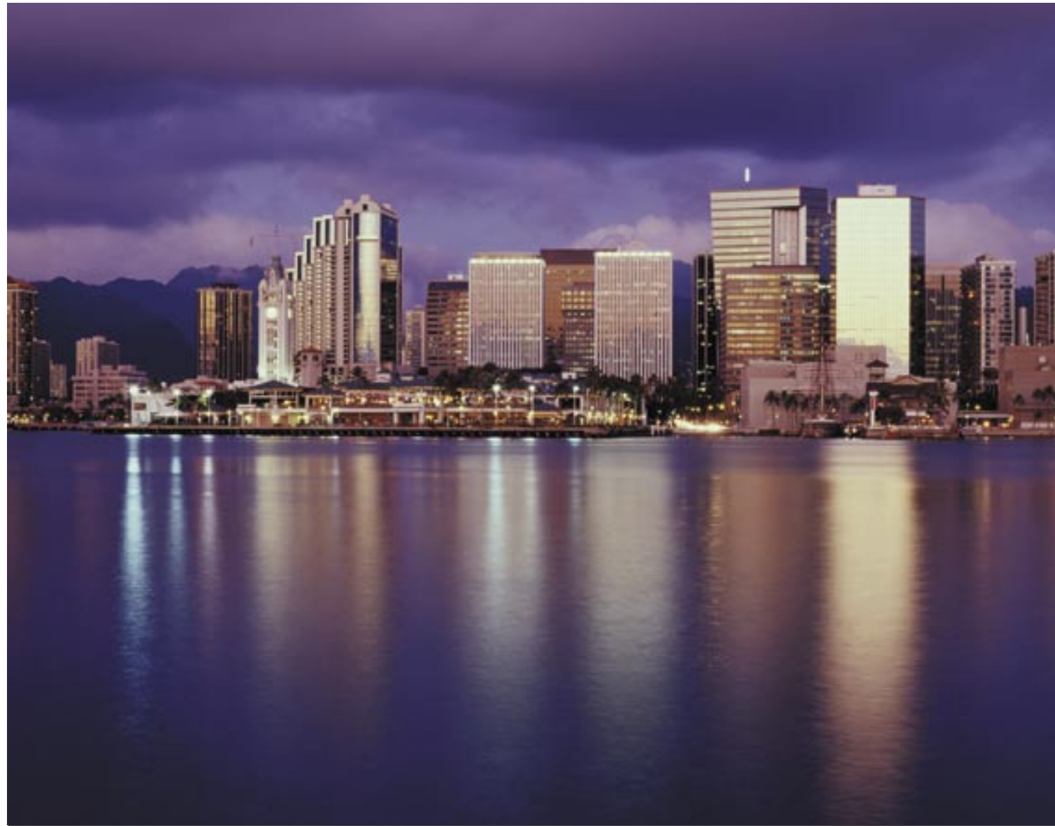
At AFF Hawaiian Ocean Transport, we offer both LCL and FCL service from all West Coast ports to Oahu and the neighbor islands.

There's a simple way to eliminate the aggravation and confusion involved in shipping between the mainland and Hawaii: call us—AFF Hawaiian Ocean Transport. We're the logistics experts specializing in service between the